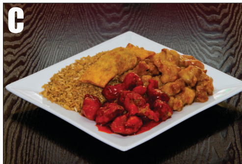
Sweet & Sour Chicken with Lemon Chicken