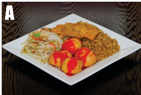
Vegetable Chop Suey with Sweet & Sour Chicken Balls

Each plate comes with fried rice and one egg roll or spring roll