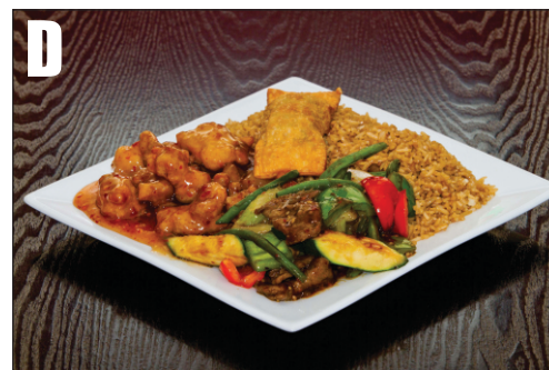
Sweet Chilli Chicken with Szechuan Beef