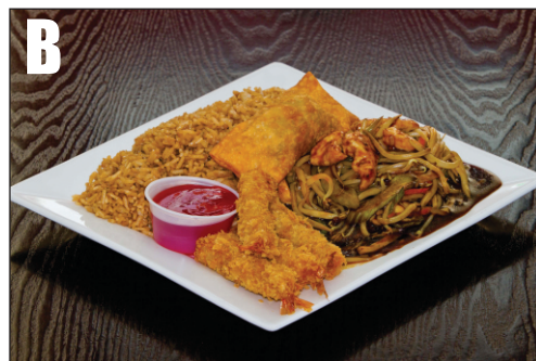
Chicken Teriyaki with Sweet & Sour Shrimp